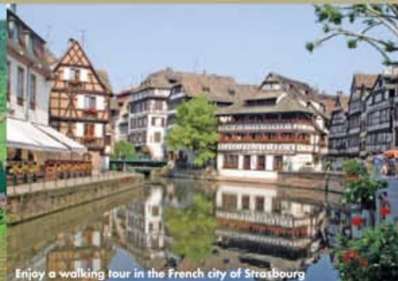
Enjoy a walking tour in the French city of Strasbourg